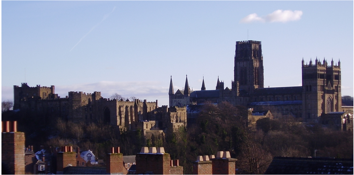
(Durham Castle and Cathedral)

Anglo German Medical Society ■ Deutsch-Englische Ärztevereinigung